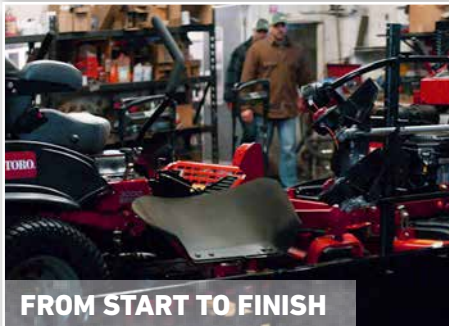
FROM START TO FINISH

From hardscape to landscape to mowing, Toro® has you covered with a full range of solutions for the jobs you need to do.