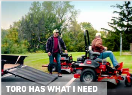
TORO HAS WHAT I NEED