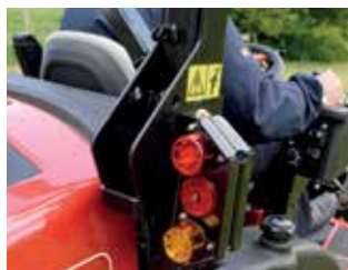
LED Lighting kit with brake lights