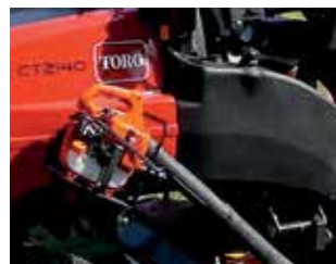
Blower/Tool carrier kit