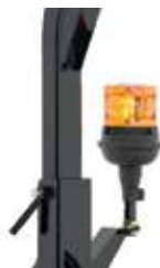
Flashing beacon kit