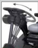
Tilt adjustable steering column