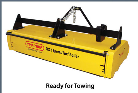
Ready for Towing